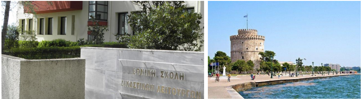
National School of Judges (ESDi) / Thessaloniki, Greece

National School of Judges (ESDi) – Thessaloniki, Greece