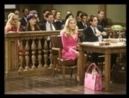
what my mom thinks i do