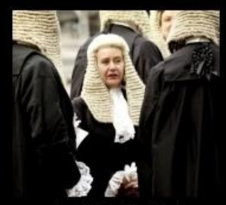
what i think i will do