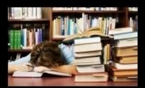
what i actually do