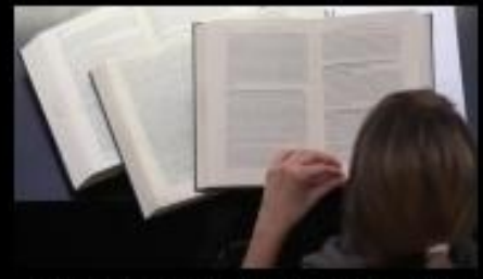
what my friends think i do