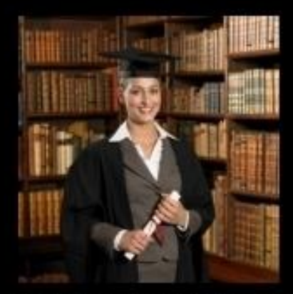
What my dad thinks i do