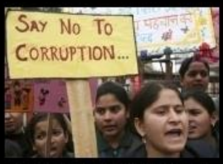
What society thinks I do.